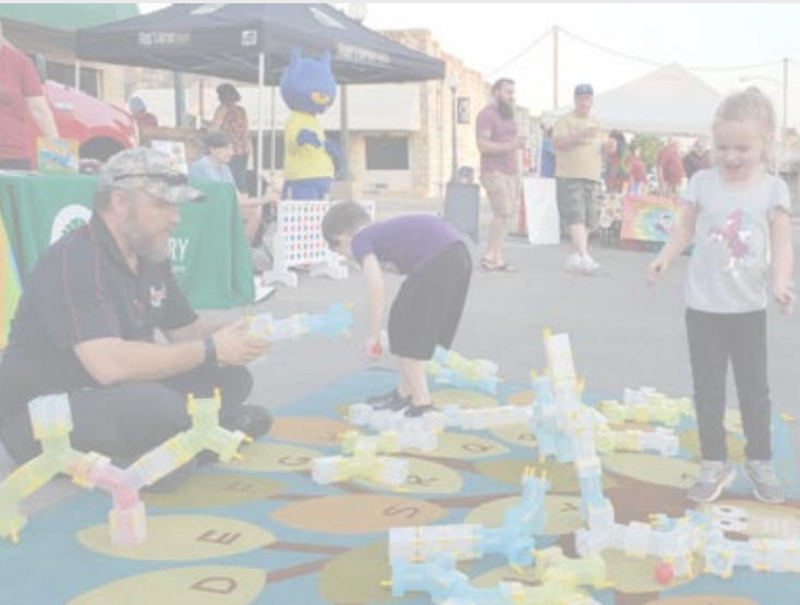
The Baxter County Library and Early Literacy Project booths were a hit at the Block Party on the Square co-sponsored by the Baxter County Library Foundation and the Friends of the Library.

Retired Teacher & Early Literacy Advocate