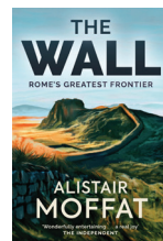
The Wall: Rome's Greatest Frontier by Alistair Moffat Aug. 6, 1:30pm