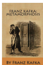
The Metamorphosis by Franz Kafka July 8, 6:00pm

Join us at Rapp's Barren Brewing Co. every 2nd Tuesday for a live reading! A portion of the proceeds will be donated to the Library Foundation.