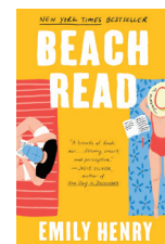
Beach Read by Emily Henry July 15, 6:00pm